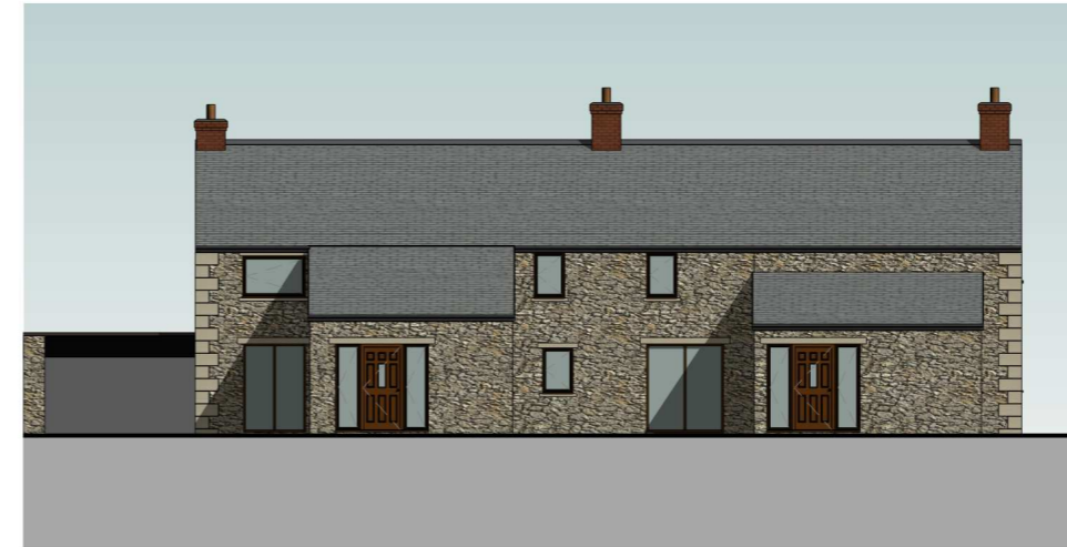
South west elevation