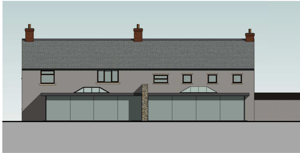
North east elevation

CUCKOLDMANS FARM, BLACKSNAPE, DARWEN, LANCASHIRE, BB3 3PP