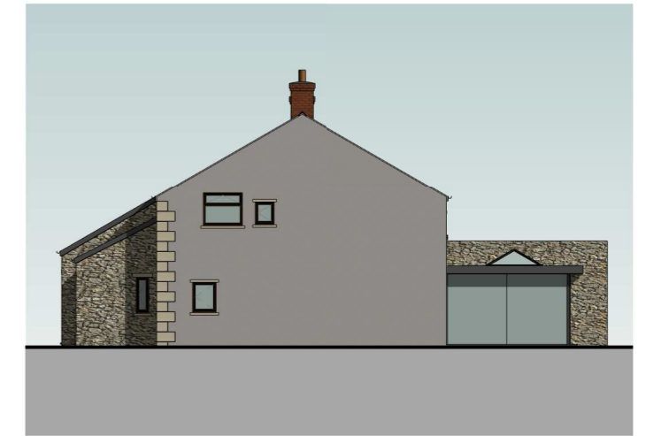
South east elevation